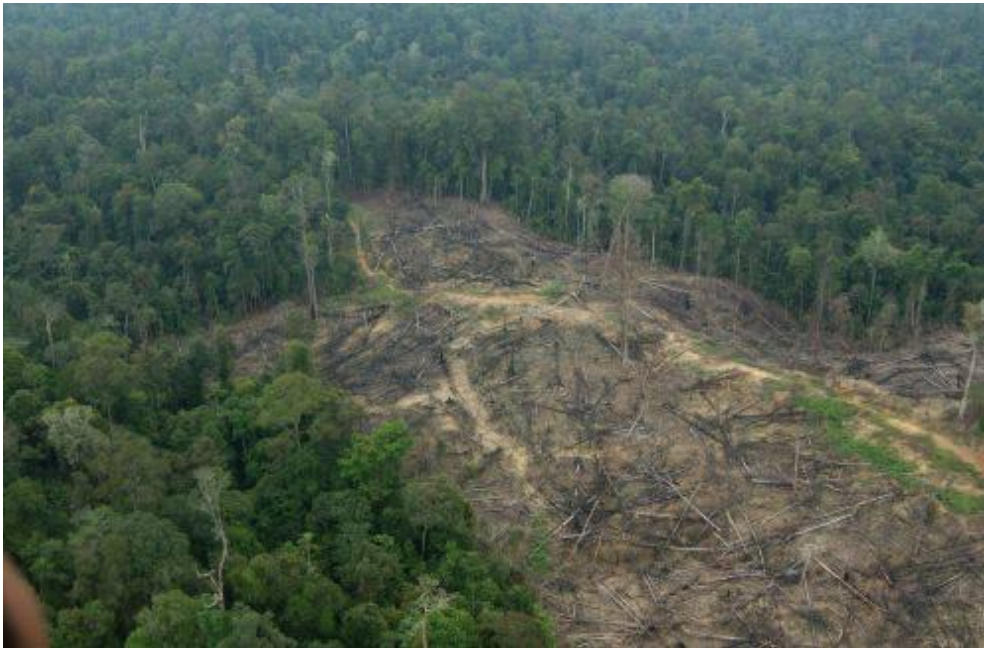
Burung Indonesia, courtesy of Eka Tresnawan