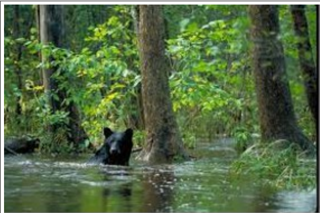
Louisiana Black Bears are another species threatened by biomass sourcing. All animals living in a forest cut down for biomass lose their home