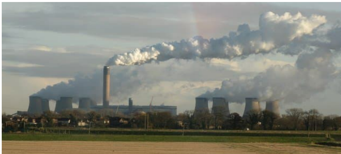
Drax power station in North Yorkshire

While it is extremely unlikely that Drax will be technologically able to fulfil its promise, there is a very real risk the company will use it to secure more funds to keep burning biomass beyond 2027, when its current subsidies will run out. Drax has in fact already submitted evidence to parliament 5 indicating that this is exactly what it is proposing by saying 'We believe that for a BECCS power project the most efficient mechanism to achieve this would be a dual power CfD and negative emissions payment' by which Drax means it wants different subsidies, one for business as usual biomass burning for electricity, regardless of capturing even a molecule of CO 2 , and another one in case it manages to capture some CO 2 .