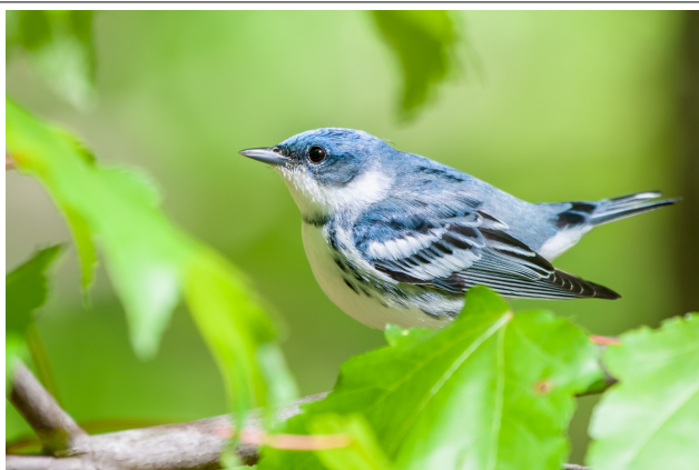
Cerulean Warbler – one of the many endangered species impacted by Drax's forest destruction

The increased global demand for wood created by subsidising biomass burning increases harm to forests resulting in increased biodiversity loss 8 Logging for biomass leads to negative impacts on Environmental Justice 9 : wood pellet mills are often sited in poor communities of colour and release significant amounts of wood dust and air pollution with associated harm to health.