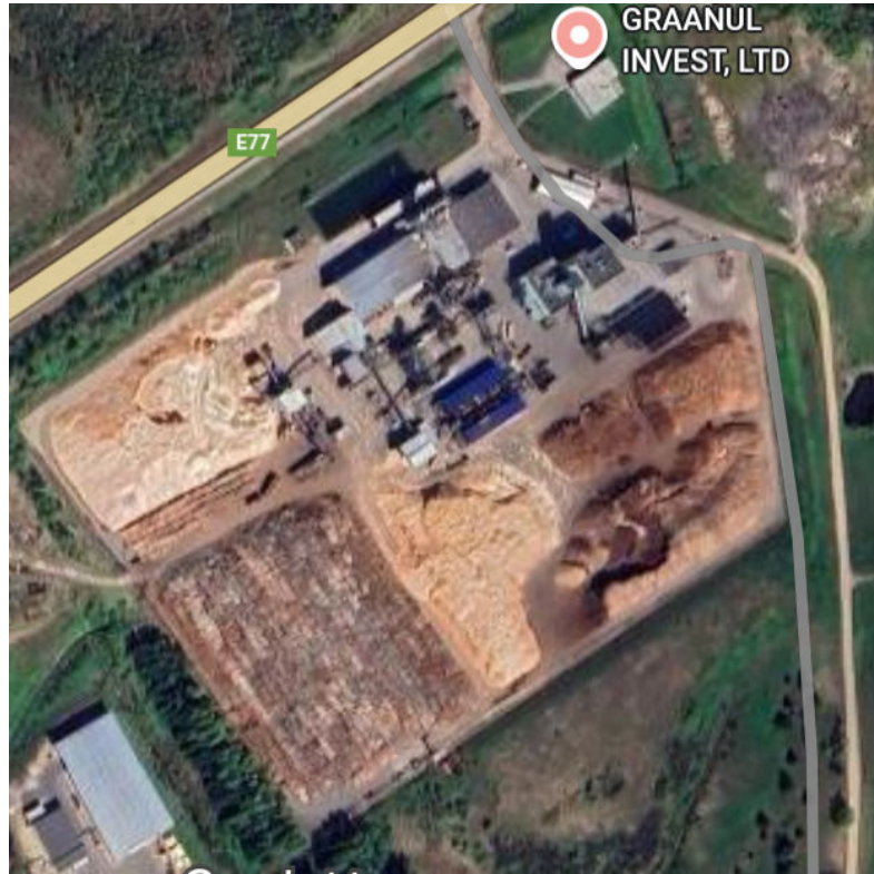
Photographs taken by NGOs also show large piles of roundwood stored at Graanul Invest's pellet plants.