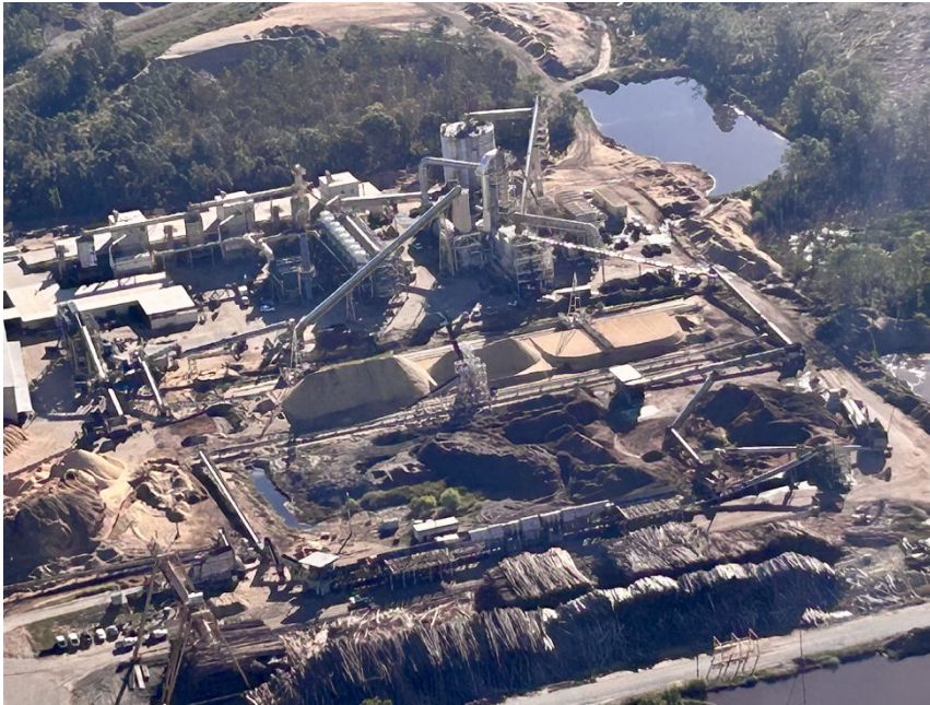
Aerial photograph of Fram Fuel's Hazelhurst Pellet plant in Georgia

In the past, RWE sourced wood pellets from the world's largest pellet producer, Enviva, who regularly source whole trees from the clearcutting of highly biodiverse coastal hardwood forests in