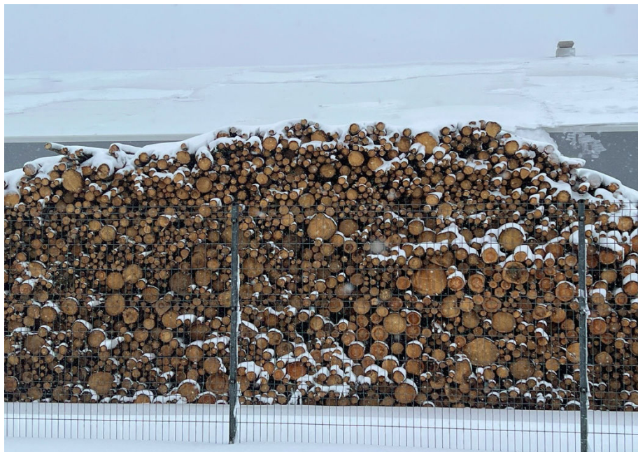
Wood stored at Graanul Invest's Osula pellet plant in Estonia