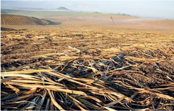
Harvested sugar cane plantation in Brazil.

Solazyme and many others claim that their microorganisms won't escape because they will be used in a closed bioreactor. A report by the Convention on Biological Diversity cautions "physical containment is never fail-proof". Solazyme's GE algae are transported across land and sea, from California to Brazil, and then they are used in an industrial refinery, largely operated by engineers, not microbiologists. This poses obvious risks of accidental release. Escaped GE microbes will be impossible to detect—unless they end up forming large populations and causing harm. Furthermore, the release of GE microbes, whether accidental or unintended, is irreversible—and it poses particular dangers because microorganisms multiply and evolve much faster than other species.