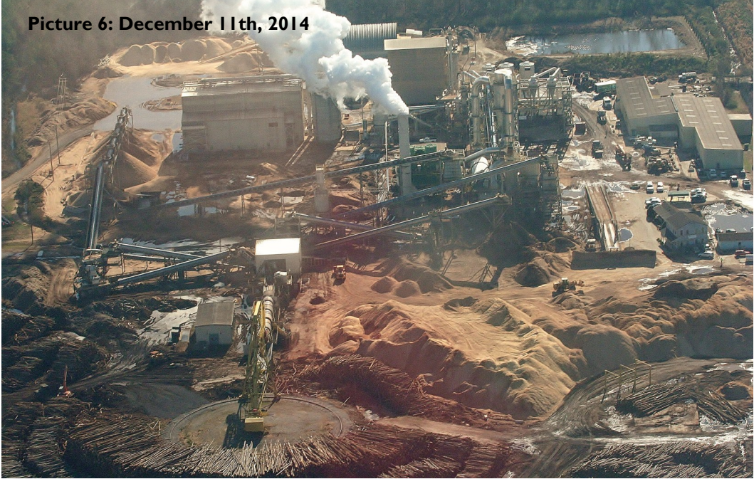
Picture 6: Enviva’s Ahoskie facility, with supplies of what appear to be whole trees and/or coarse woody residues for use in pellet production.

The maps below show the location of the logging site from where the truck in the pictures above originated. The site is located in the floodplain for the Roanoke River and adjacent to the Roanoke River National Wildlife Refuge.