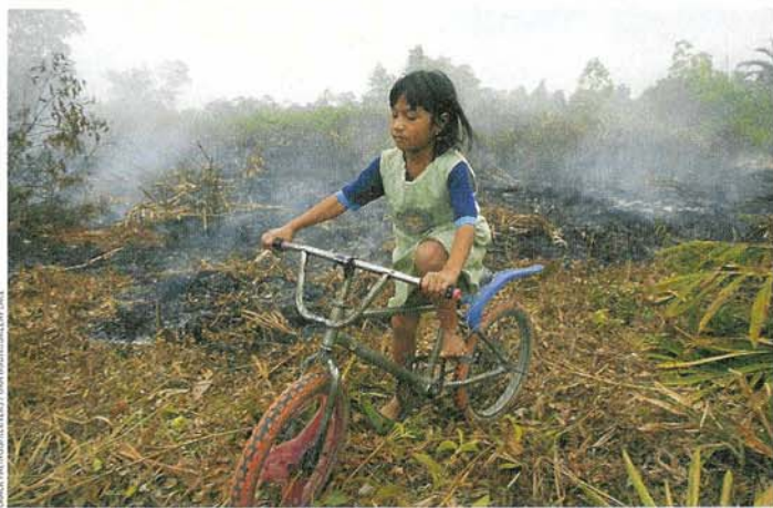
Activists block drainage canals (top). Locals say the continual fires are harming children