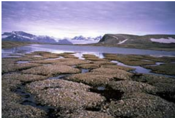
Melting Siberian permafrost is releasing large amounts of greenhouse gases. 10

Altogether, up to 400 or even 450 billion tonnes of methane or carbon dioxide could eventually be released from melting permafrost. The thawing of the Arctic sea floor could release all or part of a further 540 billion tonnes of methane stored in submarine hydrates and far greater amounts are stored in deep marine clathrates (methane ice), stored in or close to the continental shelves across much of the world's oceans. Any major methane releases from the Arctic would threaten the future of all life.