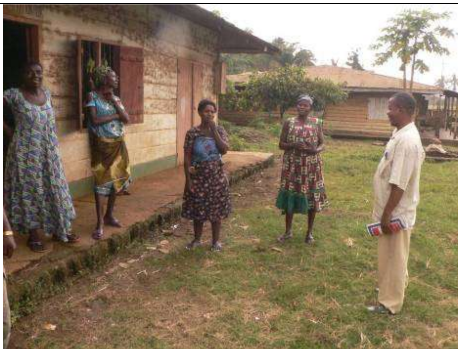
Members of Common Initiative Group discuss their experience with Biochar Fund trials.

We were told, that neither Biochar Fund nor Key Farmers formally sought the collaboration of the Region's locally based institutions, such as the departmental services of the Ministry of Agriculture and Rural Development (MINADER), the departmental services of the Ministry of Forestry and Wildlife (MINFOF), the departmental services of the Ministry of Environment and the Nature Protection (MINEP), nor the formal collaboration from regional state development programmes such as the Institute for Agricultural Research for Rural Development (IRAD), the Cocoa and Coffee Seedlings Project (CCSP) or the RUMPI Programme. However, the project succeeded in developing close collaboration with individuals from some of these institutions. For example, an extension worker with MINADER was the Key Farmers' project supervisor during the trial. Through her contacts and capacity, she easily mobilized groups that took part in the trial and she was also a key person during some thematic workshops attended by farmers. Key Farmers' coordinator obtained cocoa seedlings from the CCSP during our visit to that institution