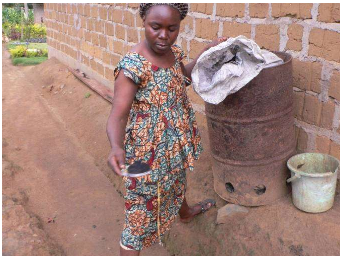
Biochar making barrel. Most of the equipment had been discarded. One group had preserved a barrel and made a batch of biochar for application to a garden following the trial.

* Legend: 1 Still in place; 2 relocated somewhere else; 3 abandoned.