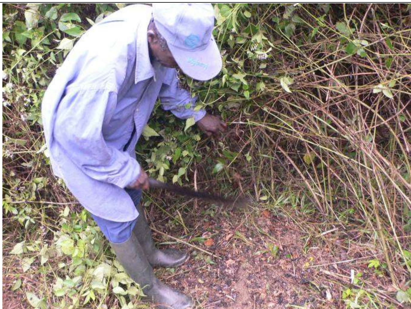
Searching for remains of biochar plot

Farmers did not always adhere to these final instructions. In some cases, this was apparently because they were concerned about security/theft. Some mentioned having grown impatient while awaiting authorization from the coordinating team, or they did not understand fully what was expected due to lack of communication.