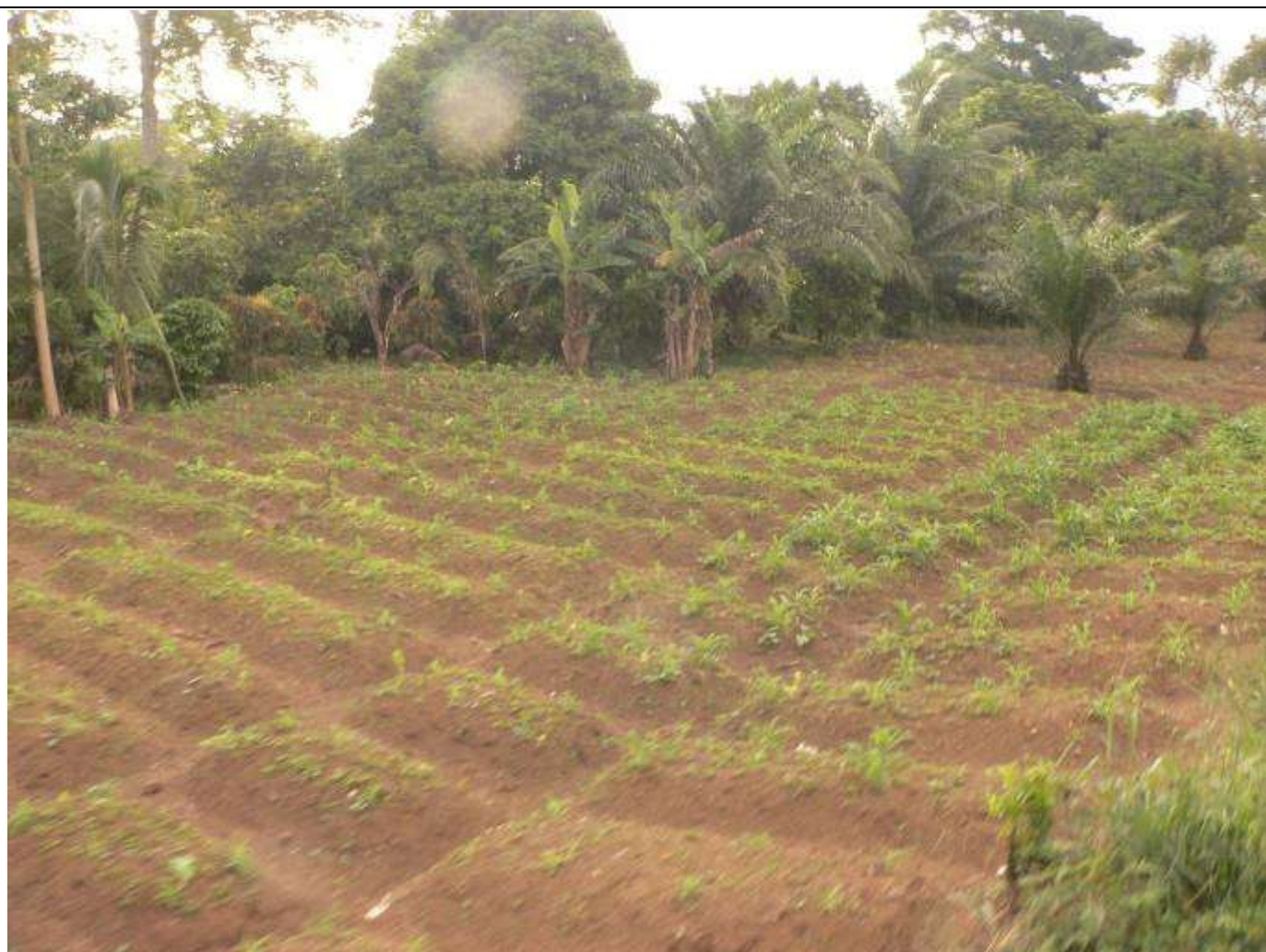
Traditional crop practices

The main cash crop is cocoa. Many of the farmers in the area are landowners and growing cocoa contributes important annual income for the family, with cocoa prices having increased since 2005-2006. Oil palms are also grown as a cash crop, but less commonly in this region.