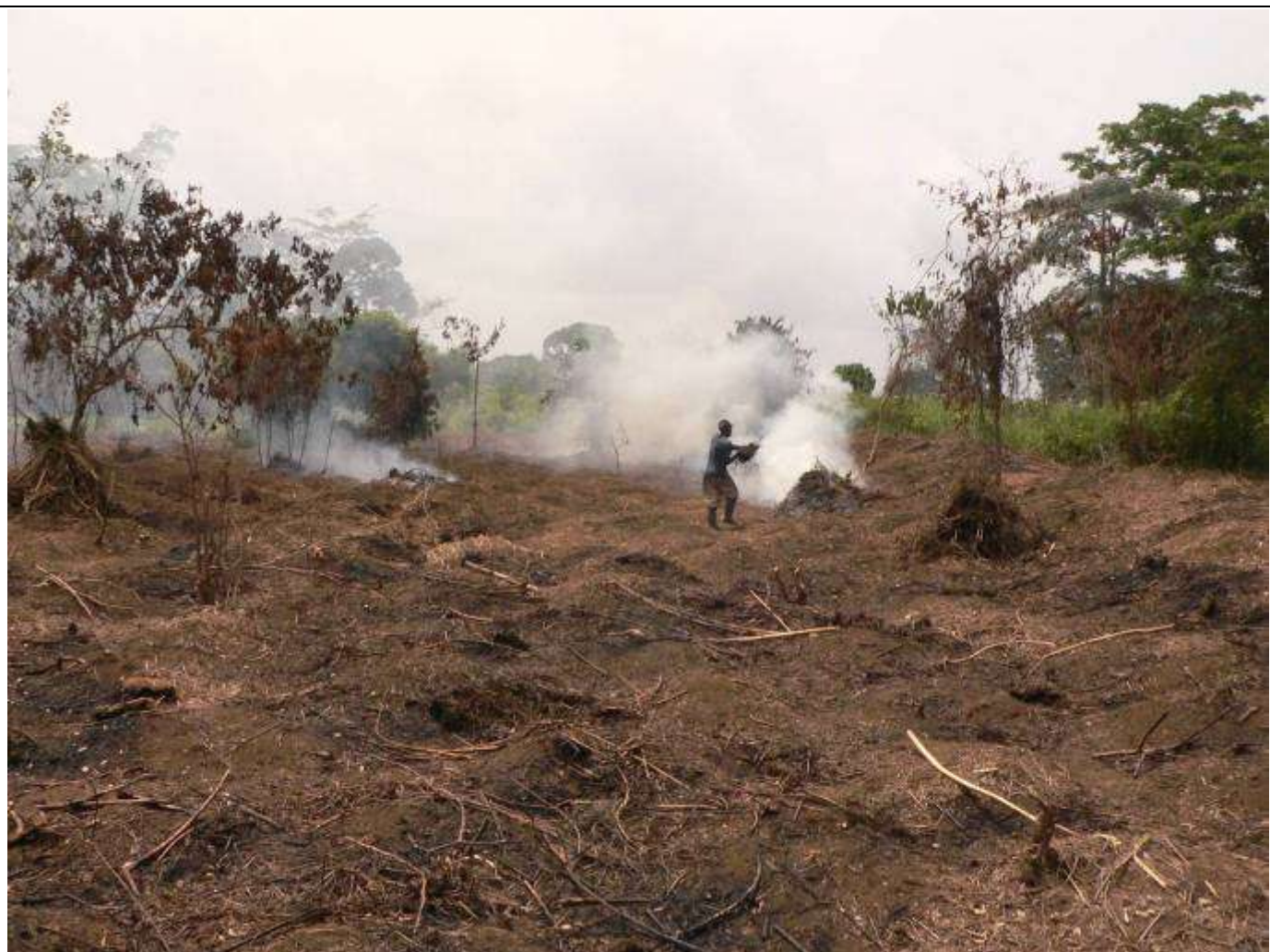
Slash and burn: clearing forest for agricultural land

This region of Cameroon is under tremendous pressure, due to economic factors strongly linked to the Structural Adjustment Programmes imposed by the IMF and World Bank. The Kumba region has grown rapidly in population and is now the largest city in Southwest Cameroon. Much of the populace is dependent upon agriculture for food and cash. Expanding demand for agricultural land both by farmers and by plantation companies (especially CDC) in combination with intense logging has resulted in serious degradation of surrounding forested lands, including the South Bakundu Reserve, which includes some of the villages involved in the biochar trials. Further details regarding forests in the region is provided in Annex 1.